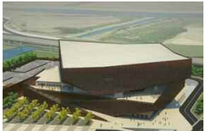
New Irving Convention Center

Winner need not be present to win and will be notified and check sent to winner's Chapter/Network. If winner is unable to attend, funds will be returned to TCAF who will notify alternate winner and her chapter/network.