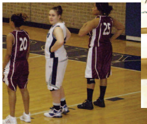
Looking at bench for instructions.