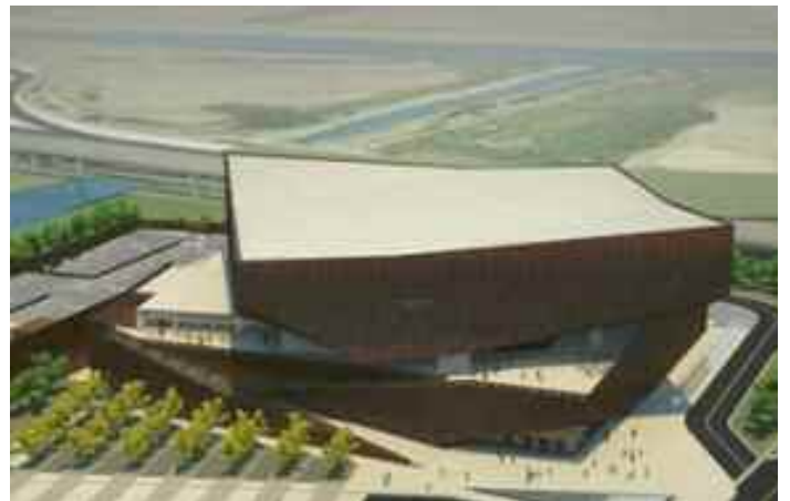
New Irving Convention Center

Winner need not be present to win and will be notified and check sent to winner's Chapter/Network. If winner is unable to attend, funds will be returned to TCAF who will notify alternate winner and her chapter/network.