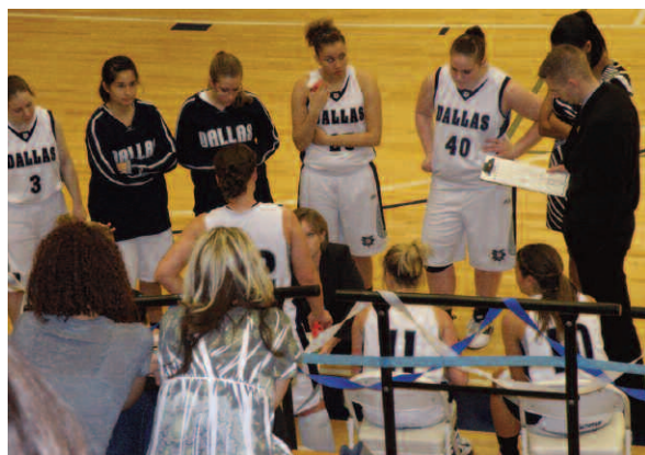
Strategy session during time out.