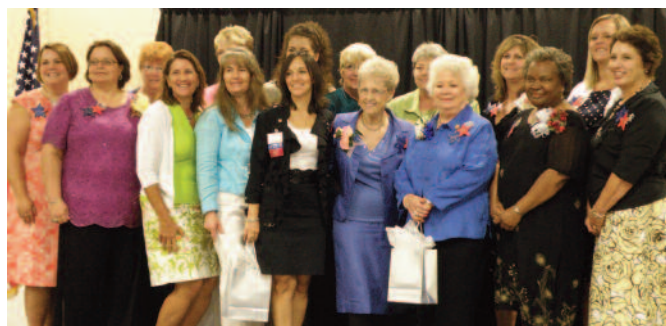
Below, group photo of all honorees.